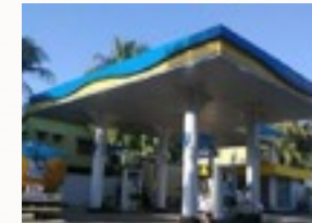
Nearest ATM Location to Petrol Pump