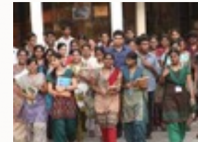
Residential Area for Vels College Pallavaram Students

Multiple Shopping areas coming up in vicinity.