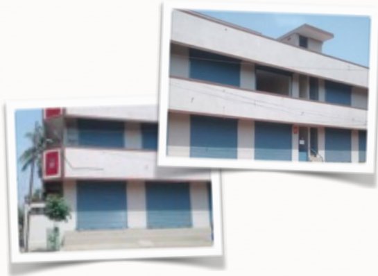
Kalpagam Business Centre: 40% Booking are Done

The benefits to your business at Kalpagam,