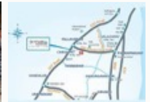
On Main Link Road Connecting to 200 Ft Road