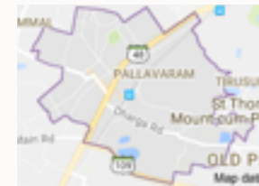
Situated in a Densely Populated Area