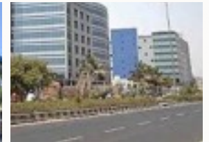
IT Companies on connecting 200Ft Road